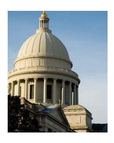
State policies on adolescent reading should be vested at the highest levels of government.

State education leaders and policy-makers should take the lead in developing statewide adolescent reading policies. This effort needs the force of legislation, governor's executive order or other initiative, or all of these. A governor's action combined with legislative support may work best. If both legislative action and executive direction are coordinated, the effort will have the strongest support, especially in the state budgeting process. Policies developed by the state education board or the chief state school officer also may be effective if the legislature and governor actively support them.